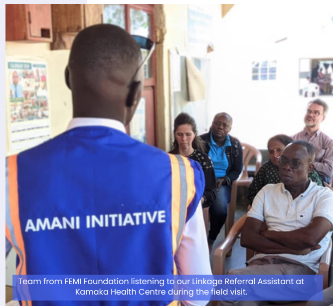
Team from FEMI Foundation listening to our Linkage Referral Assistant at Kamaka Health Centre during the field visit.

Beginning with an entry meeting with staff to understand Amani's mission, the team later held a courtesy meeting with local government and toured the Amani Elevator Facility. They witnessed Amani's healthcare initiatives, visited a beneficiary of the Scholarship Program, and engaged in a Saving and Gender-Responsive Skills session for child mothers and at risk out of school girls. Both organizations share a commitment to community welfare, aligned with principles of mutual respect and equality. Additionally, they were hosted by partner organizations within Gulu and Nwoya districts, reinforcing our collective efforts to address challenges faced by children and women in the Northern region.