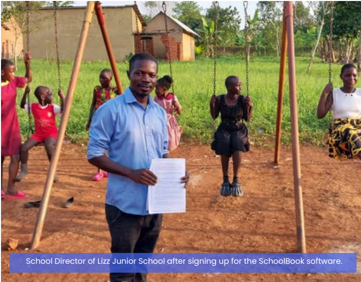
School Director of Lizz Junior School after signing up for the SchoolBook software.

In our ongoing commitment to enhance the quality of education in low-cost schools across Uganda, the School Systems Strengthening Program has been diligently working to improve learner attendance and learning outcomes.