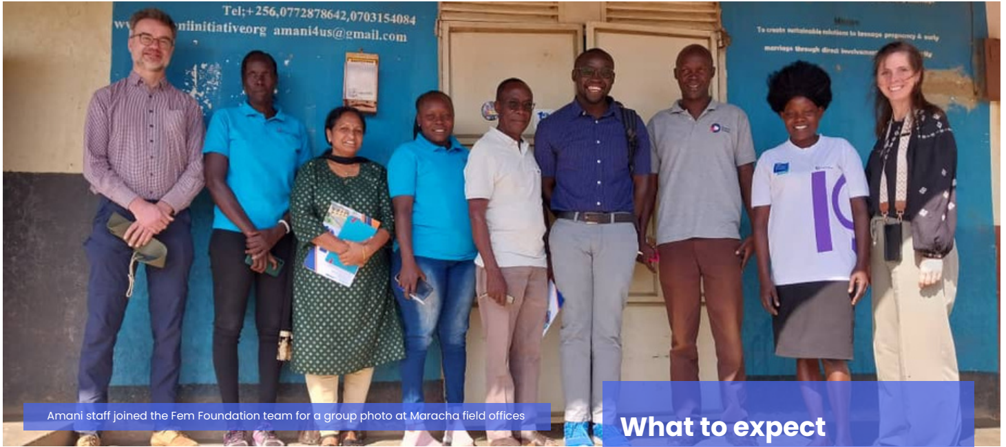
Amani staff joined the Femi Foundation team for a group photo at Maracha field offices