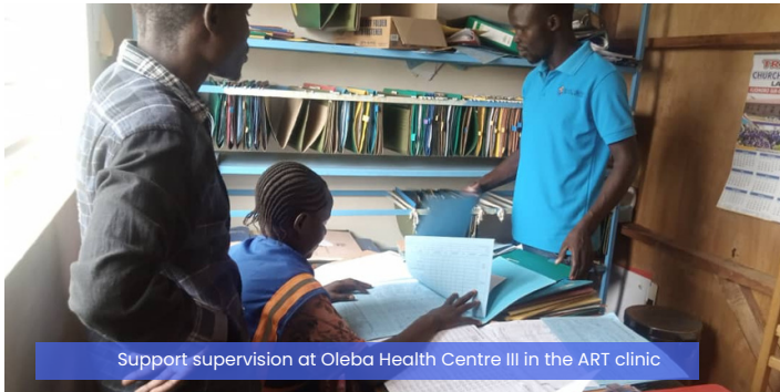
Support supervision at Oleba Health Centre III in the ART clinic

In February 2024, Amani Initiative, Infectious Disease Institute, and Centre for Disease Control continued their PEPFAR program in Uganda's Maracha District. 8 index clients were reached for testing, surpassing targets. 84 lost clients were followed up, exceeding the target by 7, with 81 resuming treatment.