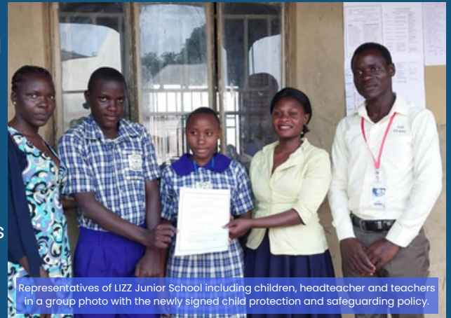
Representatives of LIZZ Junior School including children, headteacher and teachers in a group photo with the newly signed child protection and safeguarding policy.

These policies aim to create a safe and conducive learning environment for students while ensuring effective management practices within the school.