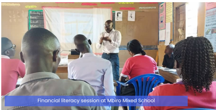
Financial literacy session at Mbiro Mixed School

As part of our efforts to improve staff wellness and concentration, a financial literacy session was conducted for the staff of Mbiro Mixed School.