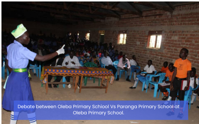
Debate between Oleba Primary School Vs Paranga Primary School at Oleba Primary School.

In February 2024, Amani Initiative initiated the 2024 Annual Inter-School Debate Competition dedicated to, addressing child protection and safeguarding.