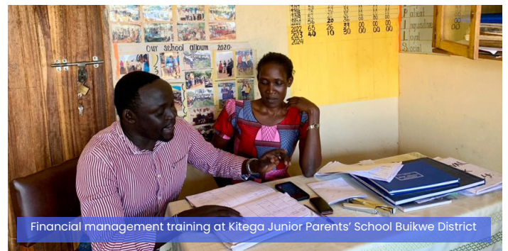
Financial management training at Kitega Junior Parents' School Bulkwe District

Schools in Arua, Nakaseke, Wakiso, and Lugazi also received comprehensive training and support in financial management.